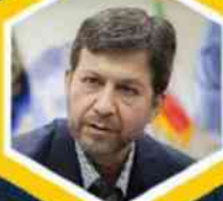
Mehdi Jamalinejad Deputy Minister of the Interior