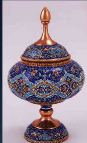
Persian Enameling (Mina-kari)