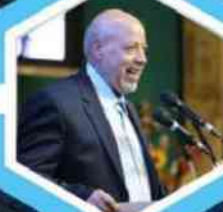
Abbas Rezaei Governor of Isfahan