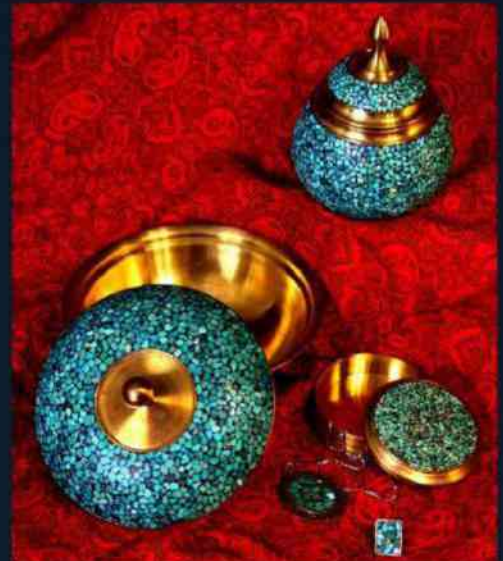
Turquoise Inlaying (Firoozeh-Koobi)