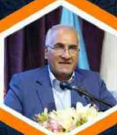
Ghodratollah Norouzi Mayor of Isfahan