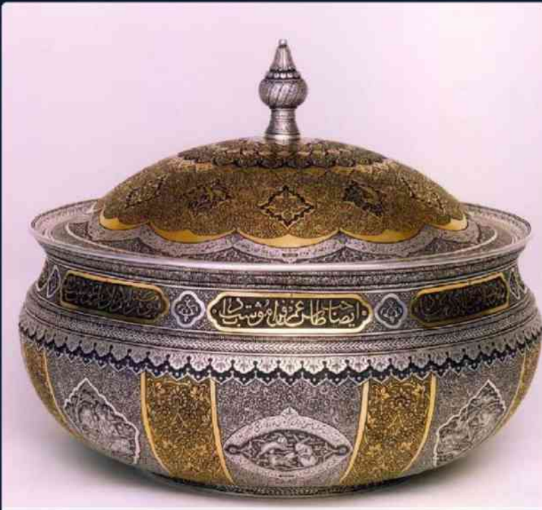
Persian engraving (ghalam-zani)