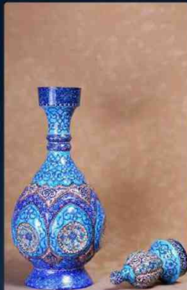
Persian Enameling (Mina-kari)